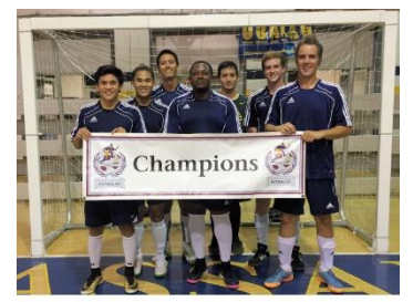
The Expendables Summer 2016 Champions Division Winner

The summer of 2016 proved to be the most exciting summer season thus far. Eight adult teams participated in the summer season with games in June and July with the team. The Expendables winning the single, large, Champions Division. In addition to announcing the division winner and awarding championship t-shirts, golden boot and golden glove awards were given out, door prizes were given to spectators, and halftime music added a festive atmosphere for all. This winter there will be sufficient quantity of teams for both a Champions Division and a First Division. Further growth will add a second division, third division, etc. as North Alabama FUTSAL continues winter and summer seasons each year.