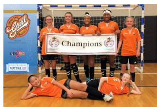
RCUSC Wildcats '06G 12-14U(MS) Open Division Winner