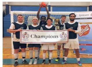
Konoha 11 Adult 'Champions Division' Winner

All teams played their best and benefitted by getting lots of touches on the ball as well as having lots of fun.