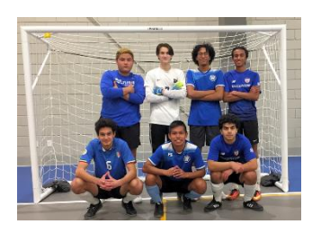
NEW ADULT TEAM, TAESETY WARRIORS

Winter futsal season started in November and will continue through January 2021. Youth divisions 10U, 12U, 17U, and one adult division are playing futsal this winter. As it has always been winter is the season with most participation. Below is a new adult team: