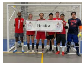
Team "PSG AMERICA"