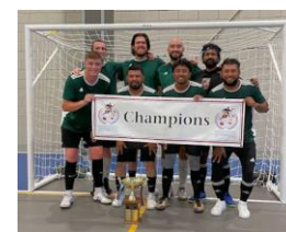
DIV. WINNER, "ROCKET CITY SAMBA"

Additionally, pickup futsal for young adults was hosted on Monday nights this summer at the Optimist Recreation Center. It was a Big Hit! It continued until mid-August. People keep asking about it. Plans are to do the same next summer.