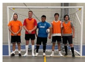
Team "2 GOALS 1 CUP"

In the 10 th summer season, North Alabama FUTSAL bounced back with 6 adult teams playing in competitive league-type games. And what an outstanding summer season it was! Below are the teams that enjoyed competing for division champion this past summer.