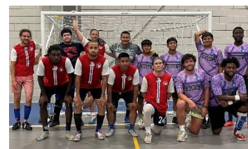
PLAYERS WHO PLAYED FRIENDLIES BETWEEN NAFL AND CFL

Again this past fall adult teams played friendlies against Chattanooga Football League (CFL) teams. It was great fun to play futsal in another environment. Below is a picture of both teams inside the Johnson Legacy Center.