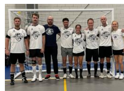
Team "THE CONTRACTORS"