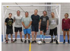
YOUTH and ADULT FUTSAL PLAYERS