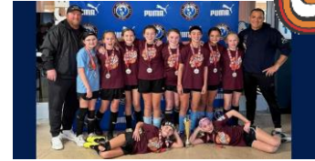
Trophies won by BY2013 and BY2015 Teams and Girls Birth Year 2013