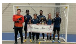
Girls Birth Year 2013 and Champions Division Winning Team, Turtles.

In the winter 2024/25 season, we added a boys BY2015 division and hosted competitive league-type games for adults again. Our girls BY2013 and boys BY2015 teams trained at home and competed in two futsal tournaments and two soccer tournaments with wins all around. Adults played competitively again.