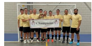
Girls BY2012 and Champions Division Winning Team, Darrell's Diamond Dolls

Finally, in the winter 2025/26 season we added additional youth programs called Tactical Thursdays and Futsal Fridays. Our four youth divisions trained under now four different programs and formed 5 separate teams to compete