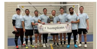
Co-ed BY2015 Players and Champions Division Winning Team, Darrell's Diamond Dolls

Next in the summer 2025 season we doubled our youth divisions to BY2016, BY2015, BY2013 and BY2012 divisions and trained again via our NAF Futsal ID and NAF Select programs, proven successful. All divisions competed in the friendlies we hosted locally and three of them competed in the Nashville Futsal Festival in Tennessee with great success. Two youth even traveled to Orlando, FL, to guest play in the United Futsal's Futsal Worlds tournament. Four adult teams competed in our Champions Division having much fun, which is what it's all about.